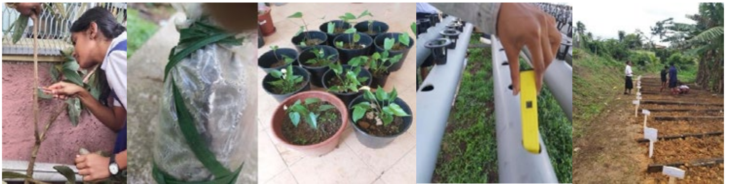
Forestry Timber utilization and visit