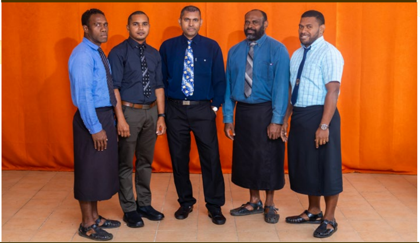
STAGE SET - UP