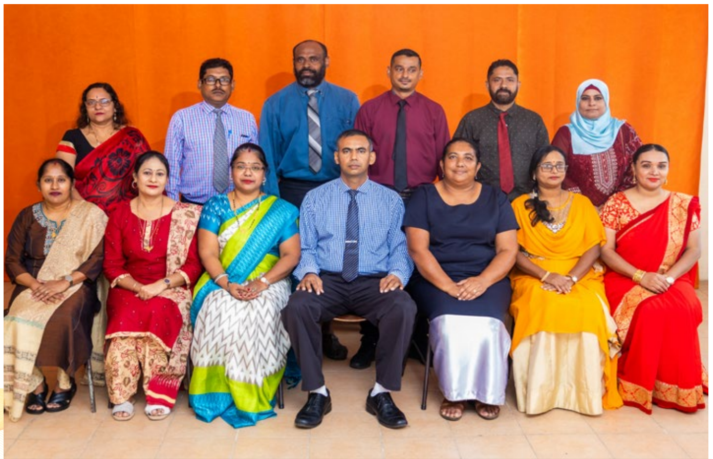
INTER DISCIPLINE COMMITTEE