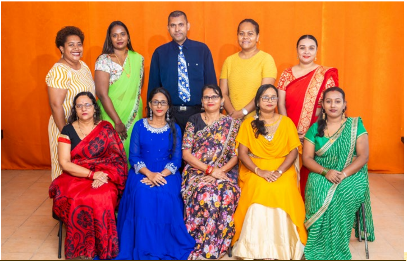
SOCIAL & WELFARE COMMITTEE