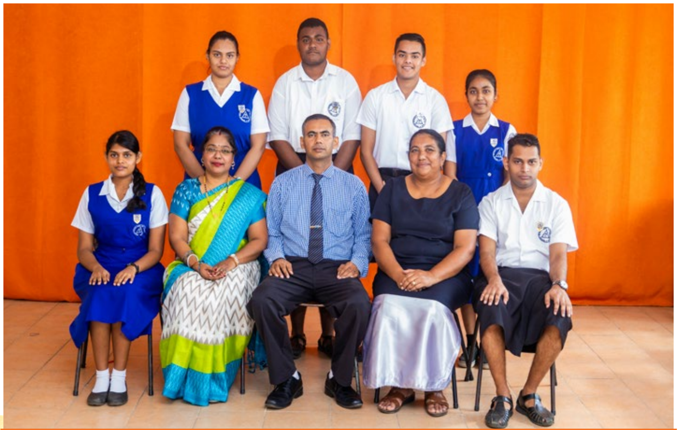
COLLEGE HEAD PREFECTS