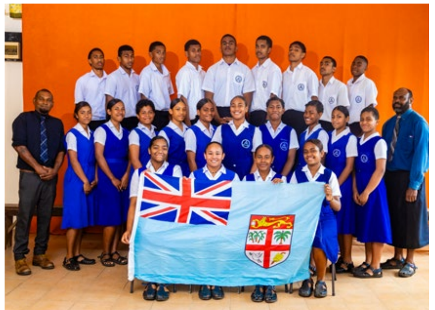
NATIONAL ANTHEM GROUP